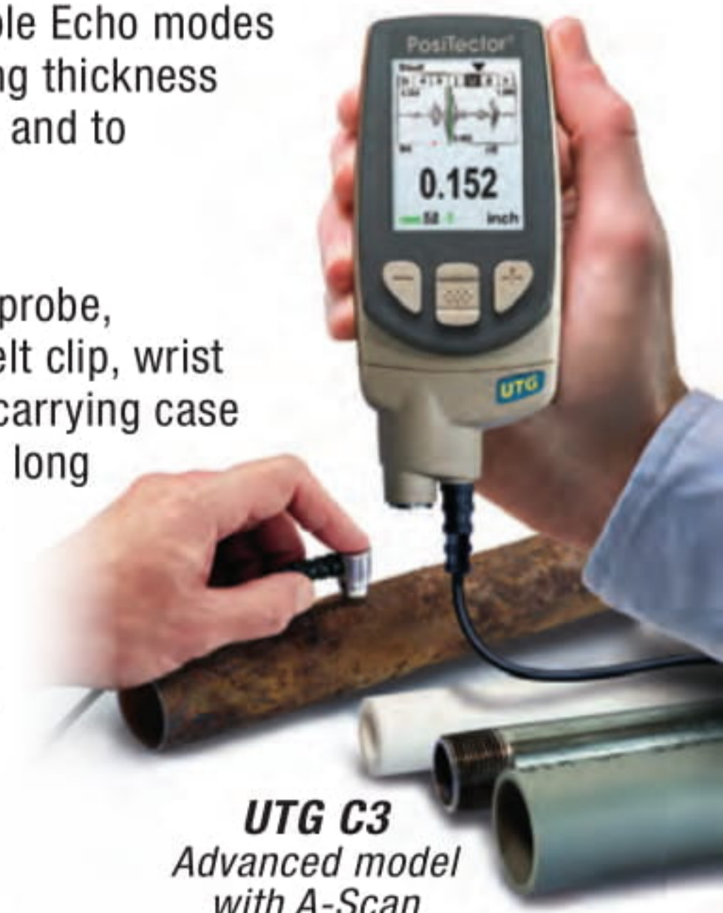
UTG C3 Advanced model with A-Scan

Weight: 140 g (4.9 oz.) without batteries Conforms to ASTM E797