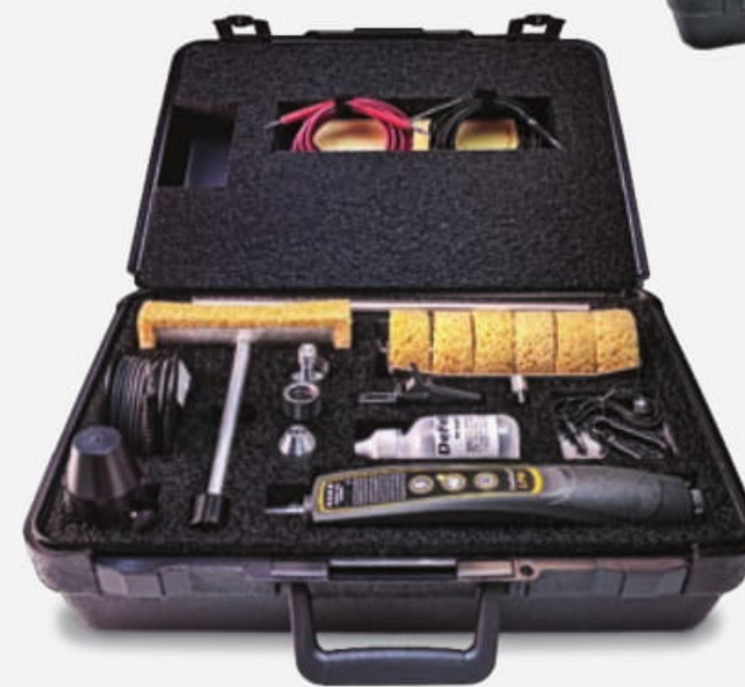
Complete Kit shown