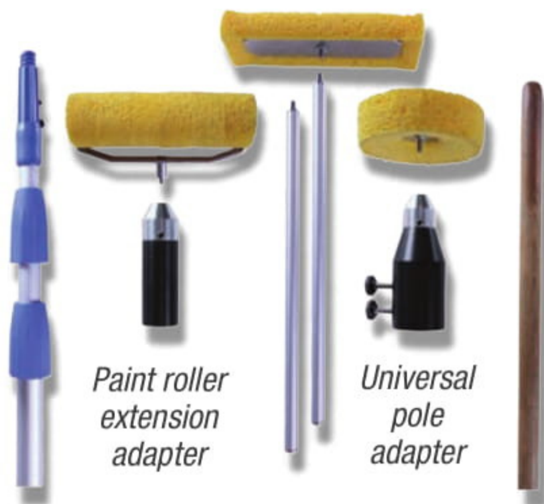
Paint roller extension adapter