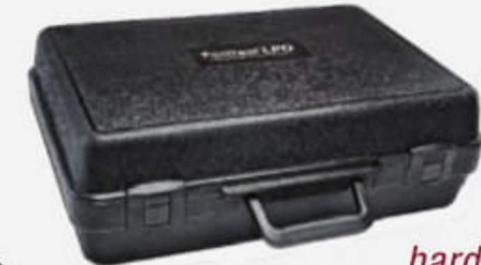
Both kits include a hard shell case